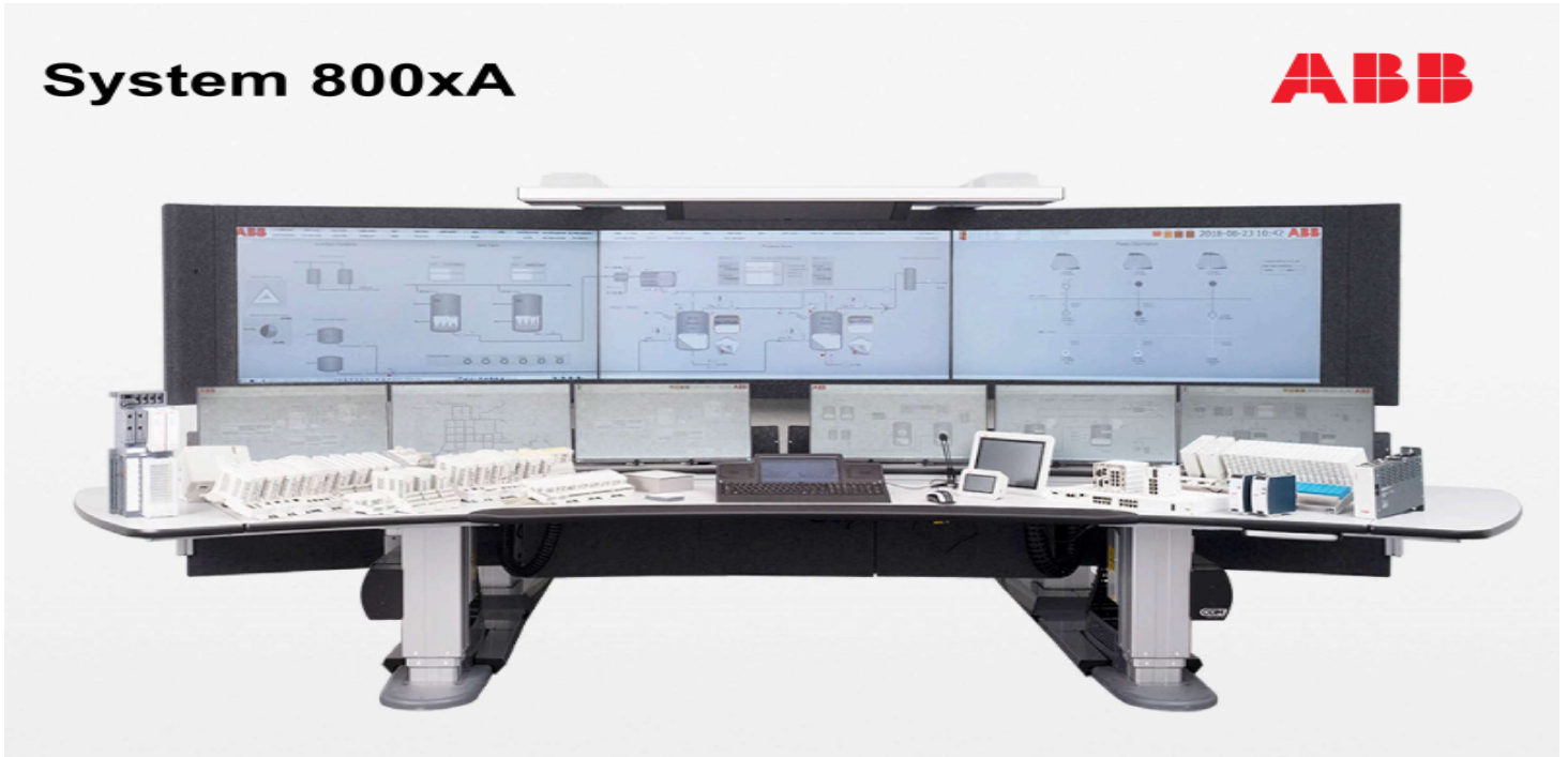
ABB 800 xA DCS